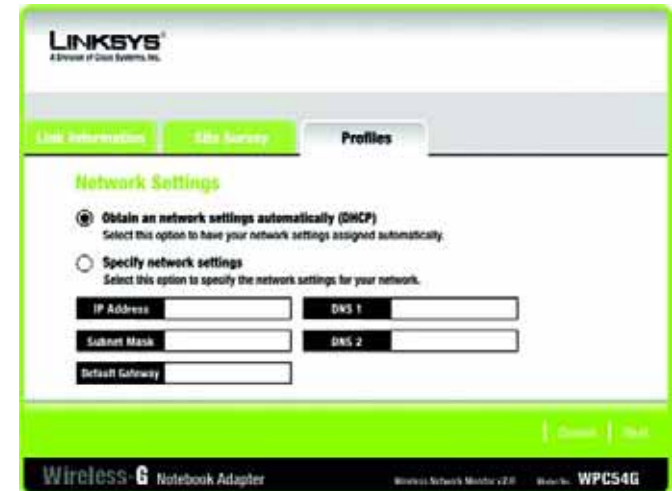
Figure 6-12: Network Settings

Click Next to continue, or Cancel to return to the Profiles screen.